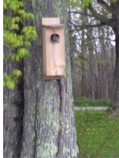
Occupied nesting box – Maple Glen, Otty Lake

Our goal is to install nesting boxes for cavity nesting waterfowl such as the wood duck, cavity-nesting tree swallows as well as bat boxes around the lake. We have started with building tree swallow nesting boxes. We have 20 boxes built so far thanks to the volunteers who built kits and/or assembled them. These nesting boxes are available to Otter Lake landowners who are interested in installing, maintaining and monitoring them for nesting activity over the next few years.