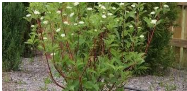
Red Osier Dogwood

Wildflowers: Swamp Milkweed, Cardinal Flower, Blue Flag Iris