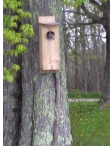
Occupied nesting box – Maple Glen, Otty Lake

Our goal is to install nesting boxes for cavity nesting waterfowl such as the wood duck, cavity-nesting tree swallows as well as bat boxes around the lake. We have started with building tree swallow nesting boxes. We have 20 boxes built so far thanks to the volunteers who built kits and/or assembled them. These nesting boxes are available to Otter Lake landowners who are interested in installing, maintaining and monitoring them for nesting activity over the next few years.