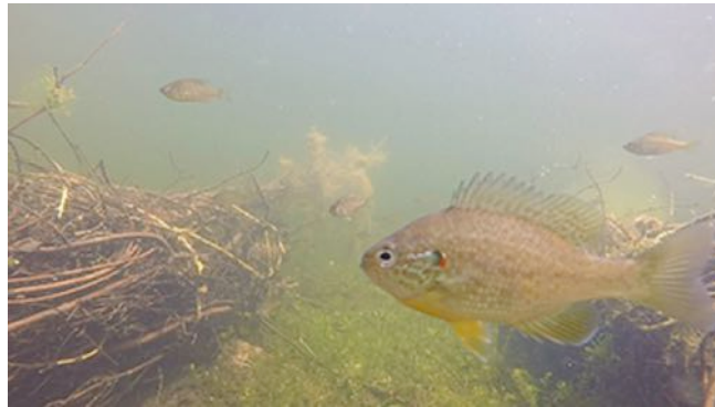
Example of a Submerged Brush Bundle Installation

Call, text or email me. June Finless at 613-797-4096 or INFO@otterlake.org